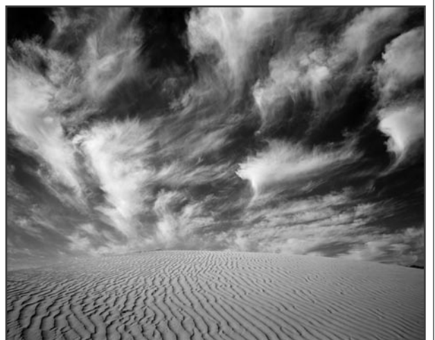
Mesquite Flat II 16"x 20"