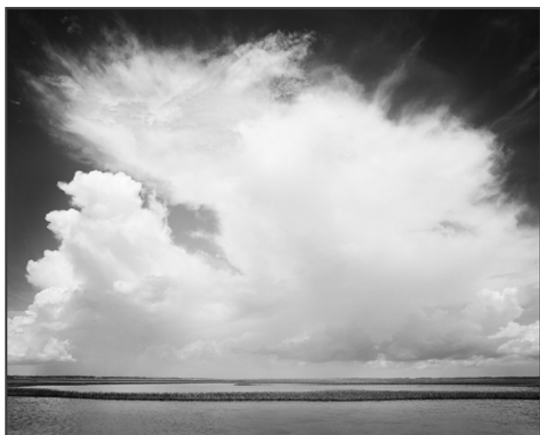
Marsh VIII 30"x 40"