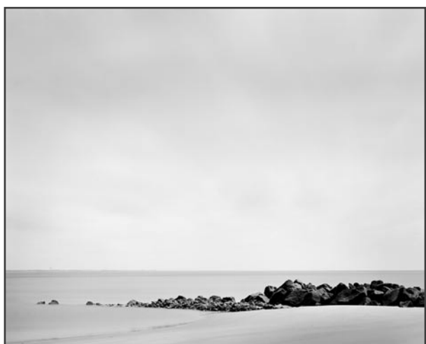
Folly Beach III 16"x 20"