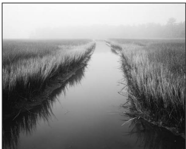
Marsh IV 20"x 24"