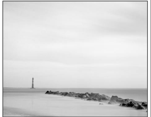
Folly Beach I 16"x 20"