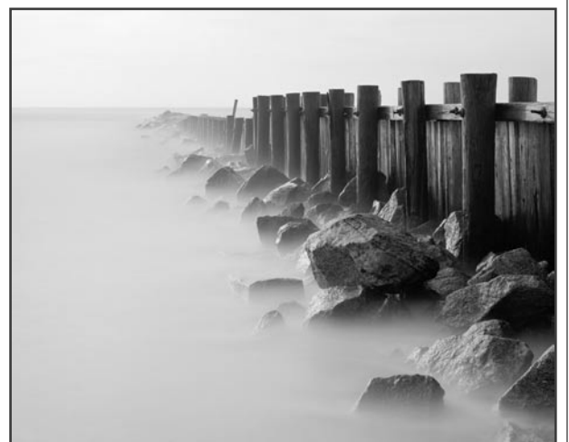
Folly Beach II 16"x 20"

58 Broad Street Charleston, South Carolina 29401 843.722.3660