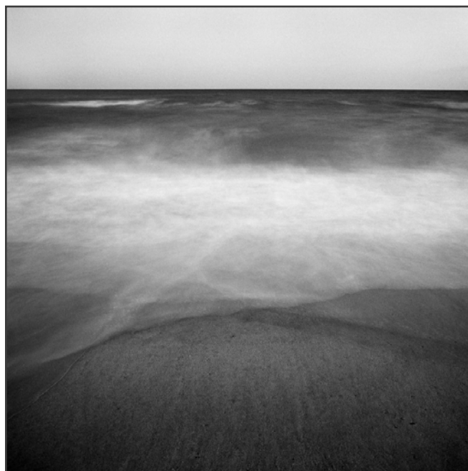
Atlantic Beach I 20"x 20"