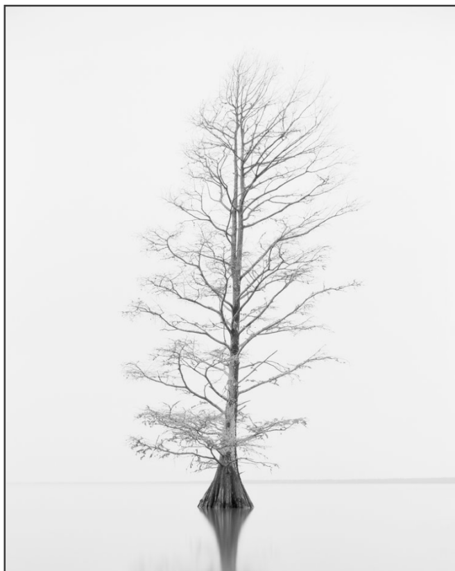
Cypress Study VIII 24"x 20"