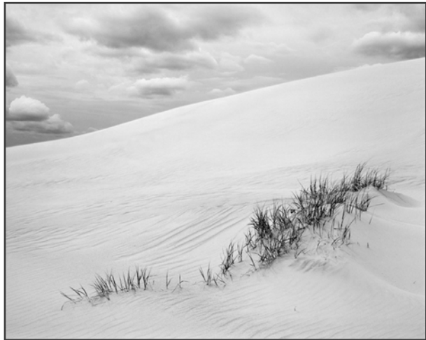
Jockey's Ridge V 16"x 20"

Reception June 1, 5:00 - 8:00 pm | Exhibition June 1 - 30th, 2018