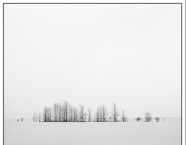
Cypress Study I 20"x 24"