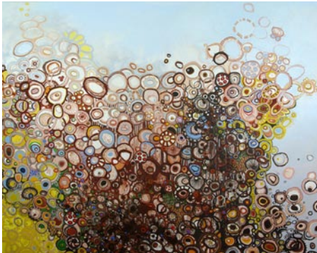
Work by Orr Ambrose

These are the simple building blocks of life. Atoms are the building blocks of matter in the same way solar systems are the building blocks of galaxies. Ambrose constructs her paintings in much the same way. Starting with simple geometric shapes and lines, she meticulously connects them to each other line by line and shape to shape. This creates a unique perspective which may