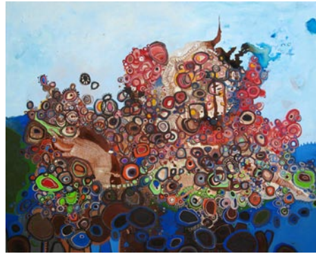
Work by Orr Ambrose

The Invisible Landscape explores the theories of cosmology, physics, and microbiology. Each painting will take us past what we can easily see on the surface, to what is unseen. The objective is to take us to places not easily imagined, and find in those places, hidden worlds full of magnificent patterns often seen only when looking through a microscope.