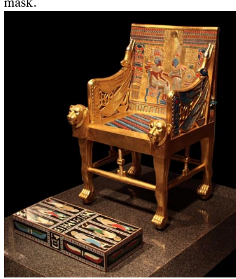
The incredible throne and ceremonial footrest of King Tut. This marvelous replica of the "boy king's" coronation throne bore his name in its earlier, heretical Tutankhaton form and portrayed an intimate domestic scene of the young royal couple.

Also to be seen is perhaps the most instantly recognizable symbol of the young pharaoh, King Tut's spectacular funerary