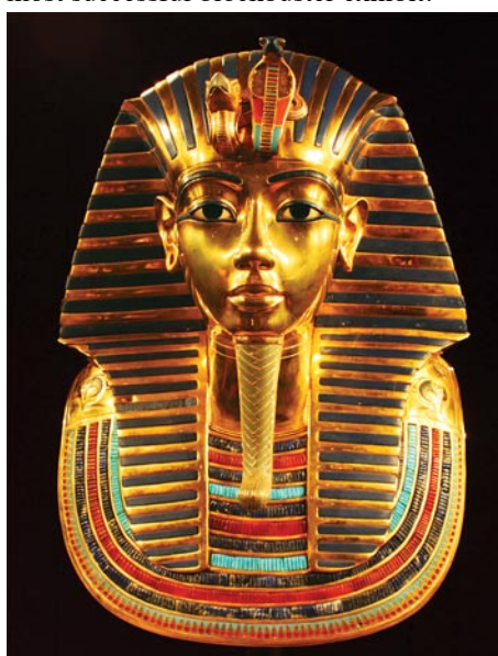
The fabulous funerary mask of King Tut is only one of 124 stunning replicas of the original treasures of Egypt's "boy king".

The fabulous treasures of King Tut's tomb will be highlighted by an exhibit of epic proportions when the South Carolina State Museum in Columbia, SC, celebrates its upcoming 25th anniversary by bringing back to the Palmetto State its most successful blockbuster exhibit.