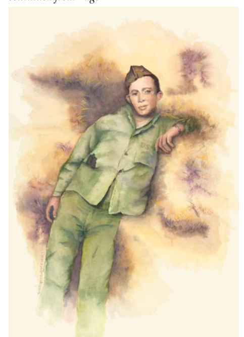
Work by Carol HasBrouck

the Carolinas and Georgia, working in the plastic mediums (painting, drawing, sculpture, etc.), to submit work to be considered for inclusion. All entries were to fall within the theme of "Patriotism", whatever that artist's interpretation of the word may be (pa·tri·ot·ism p\bar{a} -tr \bar{e} - \partial -t-z- \partial m , noun devoted love, support, and defense of one's country; national loyalty. Origin: 1720-30; patriot +