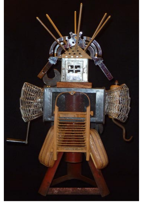
Work by Lou Webster

The layering and mixing of materials with textiles continues to be an influence that binds Webster's professional and studio work. Currently she is exploring the use of recycled and upcycled materials in her sculptural character studies.