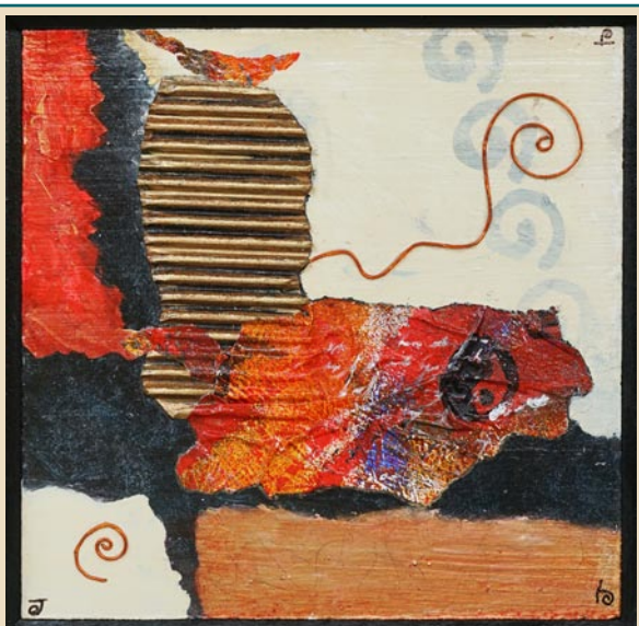
Awareness of the One, 9.5 x 9.5 inches

10283 Beach Drive SW Calabash, NC 28467 910.575.5999 www.sunsetrivermarketplace.com