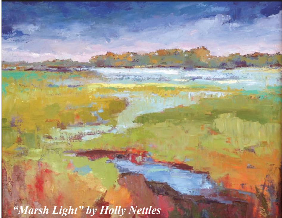
"Marsh Light" by Holly Nettles

323 Pollock Street • New Bern, NC 28560 Hours: Monday - Friday 10:00 am - 6:00 pm Saturday 10:00 am - 5:00 pm • 252.634.9002 www.fineartatbaxters.com