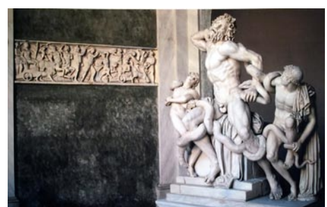
Work by Dr. Fred McElveen

images of Columbia such as the Gervais Street Bridge, but his artistic vision transforms these familiar sights into classic and romantic icons of place. The exhibit will include streetscapes, landscapes, close-ups, and images the photographer captured on his travels.