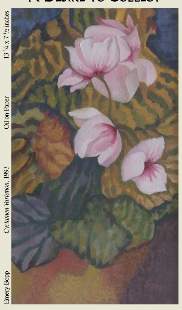
THROUGH JULY 30, 2016

3110 Wade Hampton Blvd. Suite #10 • Taylors, SC 29687 864-268-2771 • sandy@hamptoniiigallery.com www.hamptoniiigallery.com