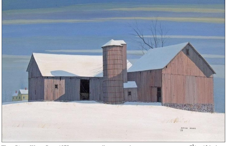
Three Rivers Winter Barn, 1973