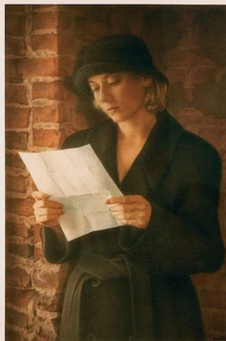
Best of Show 2010