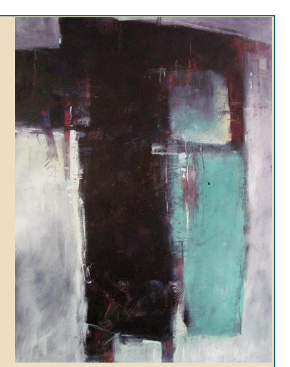
Victory Dance, acrylic by Sterling Edwards

www.sunsetrivermarketplace.com 10283 Beach Drive SW Calabash, NC 28467 910.575.5999