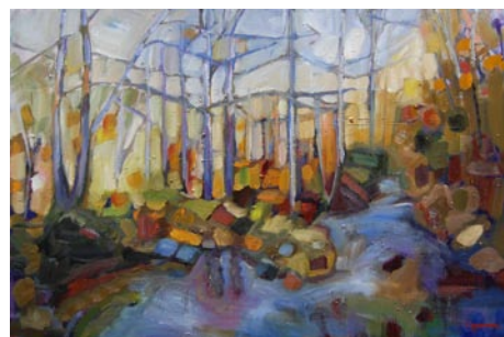
Keith Spencer, "Creekside", oil on canvas, 2014, 24 x 36 inches

The Hickory Museum of Art in Hickory, NC is presenting the work of internationally recognized artist Wolf Kahn. Wolf Kahn: Then & Now will be on view through Oct. 12, 2014, in the Museum's Coe Gallery. This is one of the most comprehensive Wolf Kahn exhibitions ever assembled. The show offers visitors the opportunity to compare and contrast similarities and differences created by an artist who is widely considered one of the premier landscape painters. The early bold, emotional landscapes are linked to the Abstract Expressionist movement of the 1940s, 1950s and 1960s. Kahn's paintings and pastels from half a century later more easily blur the distinction between abstraction and reality and also use a more heightened sense of color. For further info call the Museum at 828/327-8576 or visit ( www.hickoryart.org ).