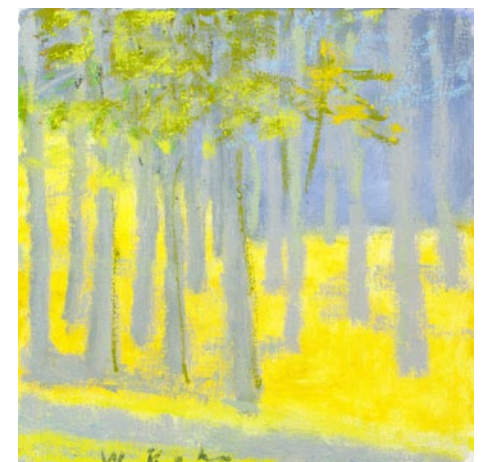
Wolf Kahn, "Yellow Uphill," 2013, 16x16", oil on canvas, Courtesy of Jerald Melberg Gallery, Charlotte, NC.

The Franklin G. Burroughs-Simeon B. Chapin Art Museum in Myrtle Beach, SC, will present Classic Images: Photography by Ansel Adams , on view through Sept. 21, 2014. A touring exhibition from the Lakeview Museum of Arts & Sciences of Peoria, IL, in affiliation with the Smithsonian Institution, Classic Images includes 72 images, all black and white, that Adams personally printed for his daughter. It is one of his "Museum Sets", a portfolio he conceived in the 1970s as the best images from his career. Landscapes dominate the group, complemented by