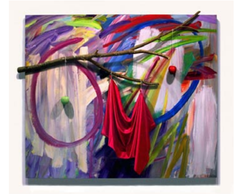
Work by Robert Tynes

some close-up nature works, portraits and architectural subjects. For further information check our SC Institutional Gallery listings, call the Museum at 843/238-2510 or visit ( www.MyrtleBeachArtMuseum.org ).