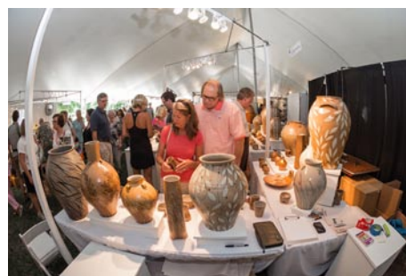
Scene from last year's Invitational

Luck's Ware is located at 1604 Adams Road in Seagrove. For more information, visit ( www.lucksware.com ) or call 336/879-3261.