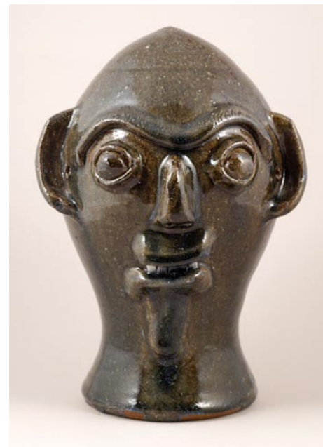
Work by Burlon Craig, Wig Stand

For further information check our NC Institutional Gallery listings, call 336/873-8430, visit ( www.ncpotterycenter.org ), or find us on Facebook.