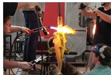
Scene from previous Hot Glass Cold Beer event

dolph Road in Charlotte, NC. For more information, visit ( www.mintmuseum.org ) or call 704/337-2000.