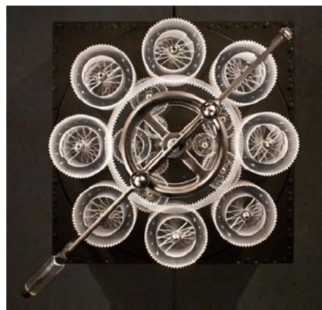
"The Bureaucracy Machine," by George M. Turner

Sechrest Art Gallery , Hayworth Fine Arts Center, High Point University, High Point. Main Gallery, Aug. 18 - Oct. 16 - "VISIONS 2014: Invention as Art". A reception will be held on Sept. 12, beginning at 7pm. High Point University will feature the work of 11 renowned artists from across the country. The exhibition explores the realm of inventions in 2D and 3D format, showing artwork in the form of drawings and sculptural works, including kinetic sculpture that started out as invention. Balcony, Aug. 18 - Dec. 5 - "High Point University Explores the Art of Seating," featuring an exhibition of innovative student and faculty chair designs. A dance recital and reception for the exhibition will be held on Nov. 14, beginning at 5pm, in the gallery. The university exhibition will provide a historical and aesthetic foundation for displaying, critiquing and contextualizing the work of faculty and student designers. Hours: Mon.-Fri., 1-5pm. Contact: call 336/841-4680.