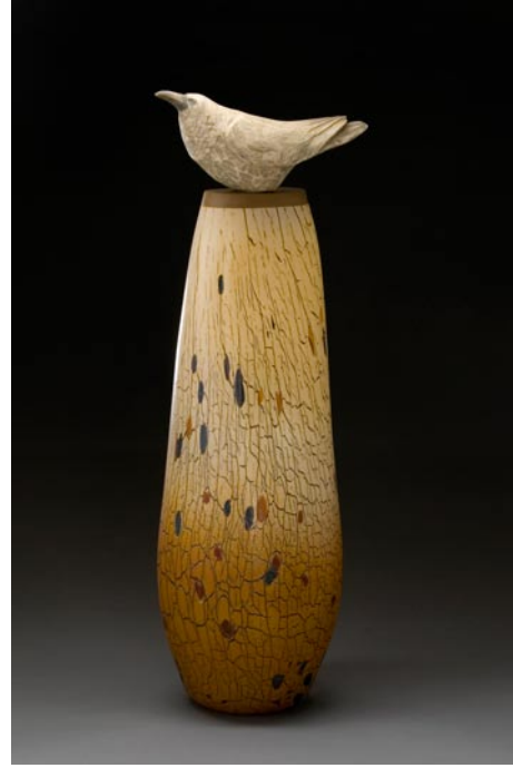
Work by Peter Wright & Hib Sabin

Bella Vista Art Gallery, 14 Lodge St., Historic Biltmore Village, Asheville. Ongoing - Featuring works by regional and national artists in a variety of mediums. Offering contemporary oil paintings, blown glass, pottery, black & white photography, stoneware sculptures, and jewelry. Hours: Mon.-Sat., 10am-6pm & Sun., 10am-4pm. Contact: 828/768-0246 or at (www. Bella Vista Art.com).