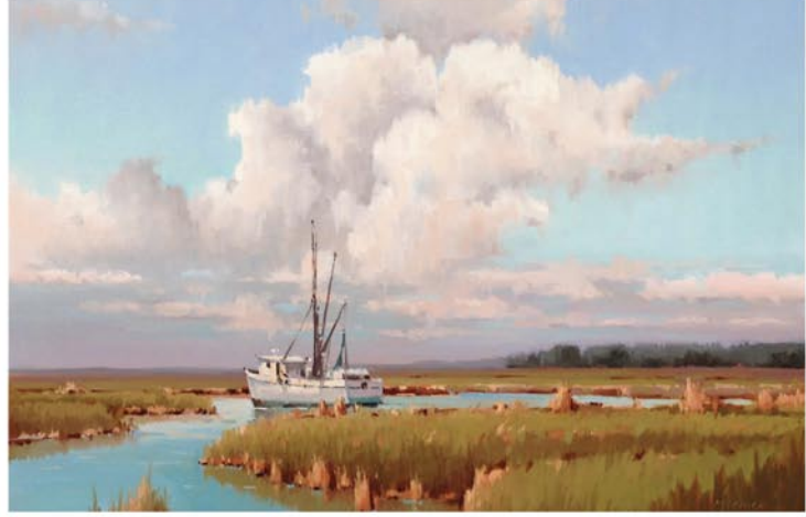
RICK McClure, Big Sky/ Low Country, 30x40, oil on canvas