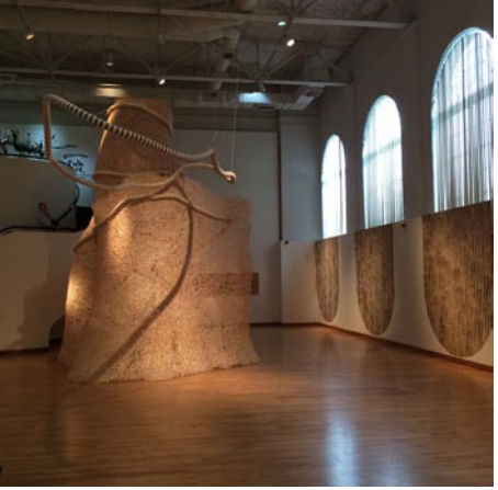
Installation by Jonathan Brilliant

featuring over 200 teapots by more than 150 of the most accomplished local, regional and national artisans, on view through Sept. 5, 2017. Cedar Creek Gallery has hosted this show every three years for the past twenty-six years. The show, which has taken place since 1989, is one of the most prestigious craft shows in the nation and is recognized for its gathering of high quality craftsmanship. The range is vast including traditional, contemporary, functional, conceptual, and whimsical teapots of pottery, wood, glass, metal, fiber and mixed media. For further information check our NC Commercial Gallery listings, call the gallery at 919/528-1041 or visit (www.cedarcreekgallery.com).