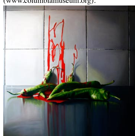
Work by Denise Stewart-Sanabria

Highlights from the Hechinger Collection, an engaging and thought-provoking look at the unexpected subject of tools, on view through Aug. 27, 2017. From the collection of American hardware-store tycoon John Hechinger, the exhibition features more than 40 paintings, sculptures, works on paper, and photographs that provide a dynamic entry point into the rich themes, materials, and processes of 20th-century art. ReTooled celebrates the prevalence of tools in our lives with art that offers affectionate, sometimes playful, tributes to tools as functional objects. It profiles 28 visionary artists including major names such as Arman, Richard Estes, Jacob Lawrence, Fernand Léger, and H.C. Westermann; photographers Berenice Abbott, William Eggleston, and Walker Evans; and pop artists Jim Dine, Claes Oldenburg, and James Rosenquist. For further information check our SC Institutional Gallery listings, call the Museum at 803/799-2810 or visit (www.columbiamuseum.org).