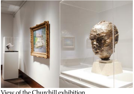
View of the Churchill exhibition

Wofford College in Spartanburg, SC, is presenting Passion for Painting: The Art of Sir Winston Churchill, an exhibi-