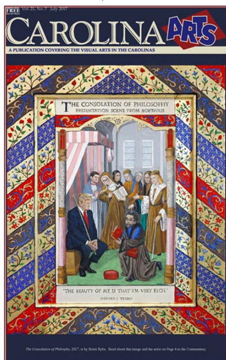
July 2017 cover by Kristi Ryba

disputed all-time most viewed cover with 7,440 views - made possible by 129 shares.