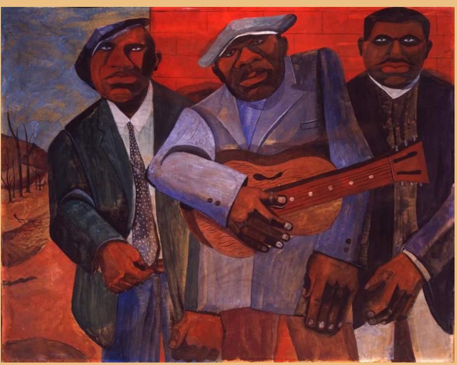
Folk Musicians, 1942, Gouache with ink and graphite on brown paper, 35 1/2 x 45 1/2 inches Curtis Galleries, Minneapolis, Minnesota