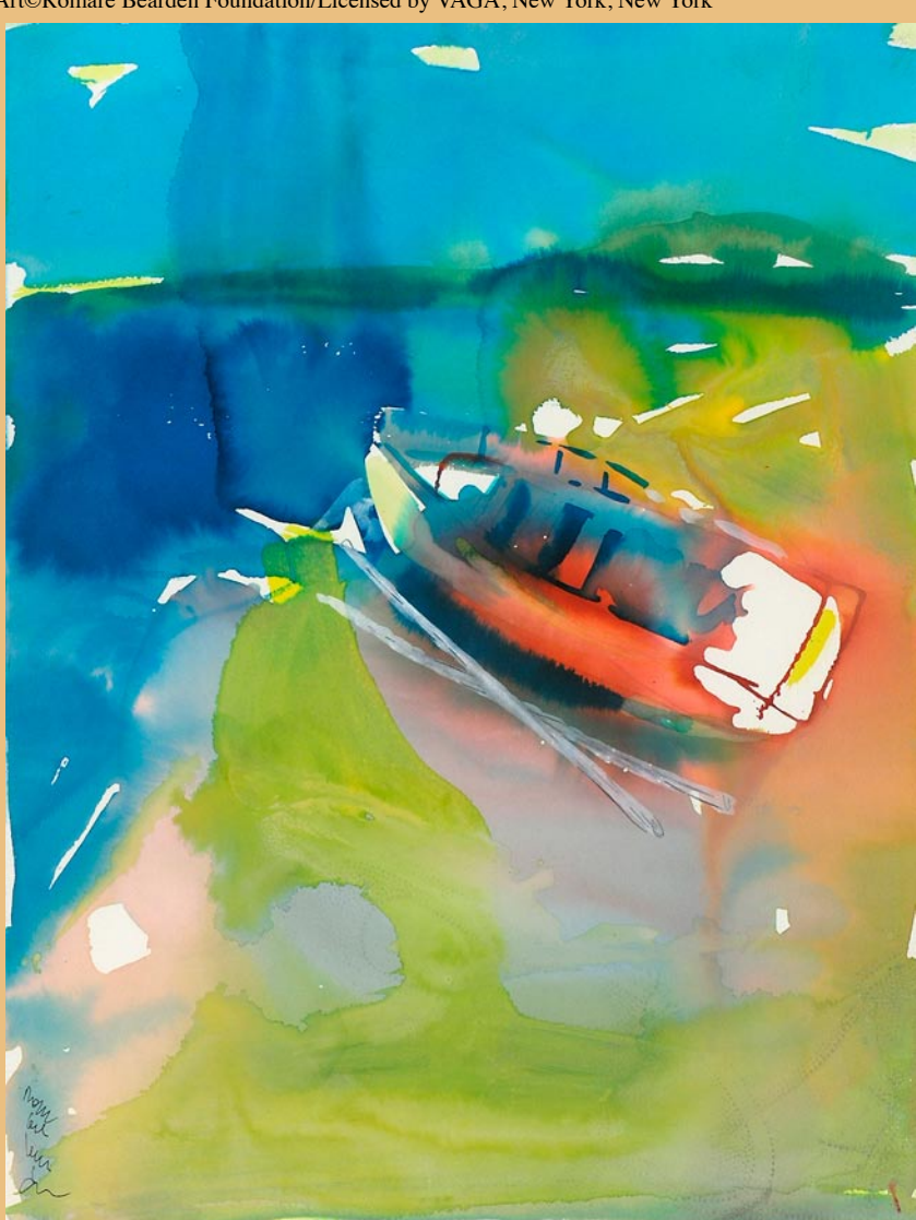
Art©Romare Bearden Foundation/Licensed by VAGA, New York, New York Grand Case Boat - St. Martin, 1984, 25.5 x 19.25 inches, Watercolor on Paper