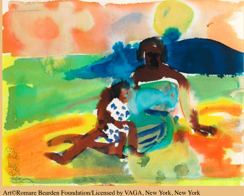
Art©Romare Bearden Foundation/Licensed by VAGA, New York, New York Mother and Child on Shore , 1979, 9 5/8 x 12 5/8 inches, Watercolor on Paper