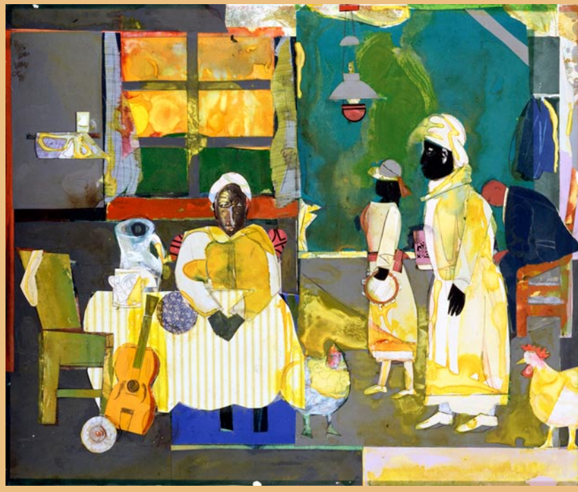
Gospel Morning, 1987, Collage of watercolor, paper, and fabric on board, 28 x 31 1/4inches American Masters Collection I, managed by The Collectors Fund, Kansas City, Missouri Art®Romare Bearden Foundation/Licensed by VAGA, New York, New York