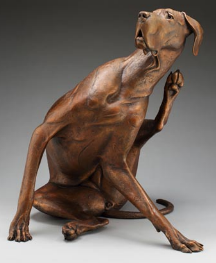
Work by Lousie Peterson

10283 Beach Drive SW • Calabash, NC 28467