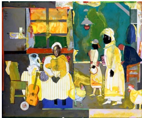
Gospel Morning, 1987, Collage of watercolor, paper, and fabric on board, 28 x 31 ¼ inches. American Masters Collection I, managed by The Collectors Fund, Kansas City, Missouri.

On Sept. 3, at 3pm - Romare Bearden's Jazz Compositions in Performance. Bearden wrote many jazz compositions but few are performed today. This is a rare opportunity to hear a selection of his musical work, and to learn about his relationships with many leading musicians. Free for Mint members, or after admission.