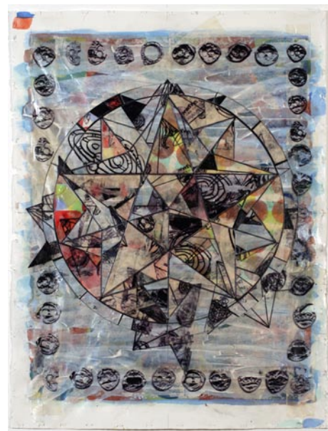
Work by Tom Dimond

show how the pair's ideas, images and media have developed over the years and how their connection to one another's work has grown steadily closer.