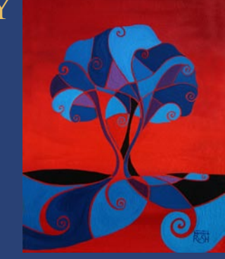
Barbara Rush, Roswell, GA

10K ROAD RACE & 5K FUN RUN - OCTOBER 19 CHILDREN'S FISHING TOURNAMENT - OCTOBER 19 PADDLESPORTS RACE - OCTOBER 20