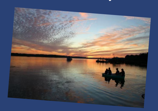
DINNER & LEARN TOUR AT WADDELL MARICULTURE CENTER - OCTOBER 14