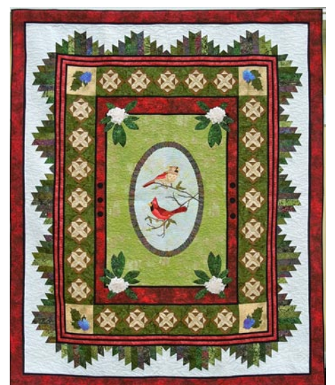
2013 Opportunity Quilt "Our Delectable Mountains" by Out of the Box Bee