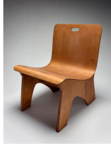
Lawrence Kocher, Plywood Chair, 1942, Plywood and screws, Black Mountain College Museum + Arts Center Collection

Black Mountain College Museum + Arts Center in Asheville, NC, will present Shaping Craft + Design at Black Mountain College , on view from Sept. 6 through Jan. 4, 2014.