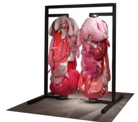
Work by Todd Stewart

CountyBank Art Gallery , The Arts Center @ The Federal Building, 120 Main St., Greenwood. Ongoing - Featuring works by local and regional artists. Hours: Tue.-Fri., 10am-5pm. Contact: 864/388-7800 or at ( www.greenwoodartscouncil.org ).