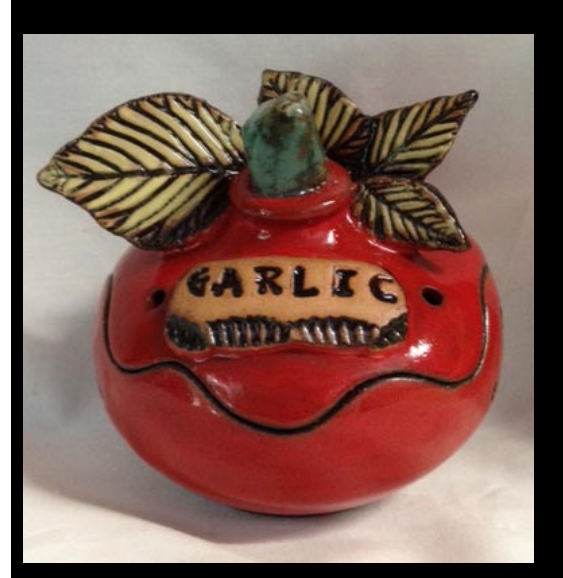
Clay Impressions / Gambino Heath Springs SC

Bring your friends and family out to 212 South Main Street in Lancaster, SC, for an old-fashioned voliday Market featuring: Artisans, Craftsmen, & voliday Vendors! View and purchase quilted items, sweetgrass baskets, jewelry, hand-crafted soap, pottery, folk art, sculpture, metal-craft, woodcraft, fashion accessories, and more!