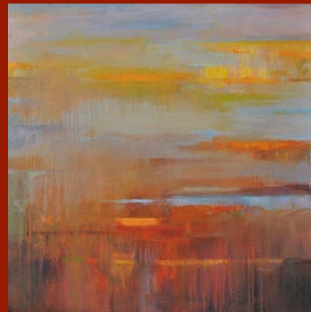
Sunset Filter oil on canvas 30" x 30"

www.LauraLiberatoreSzweda.net Contemporary Fine Art by appointment