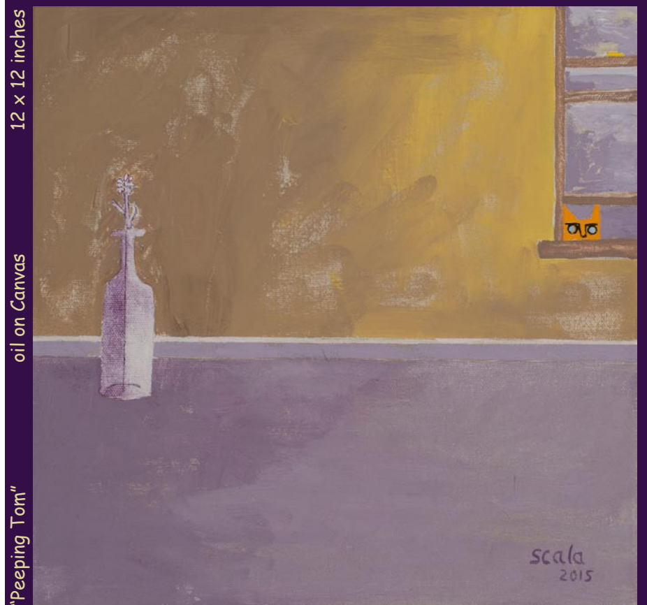
12 x 12 inches