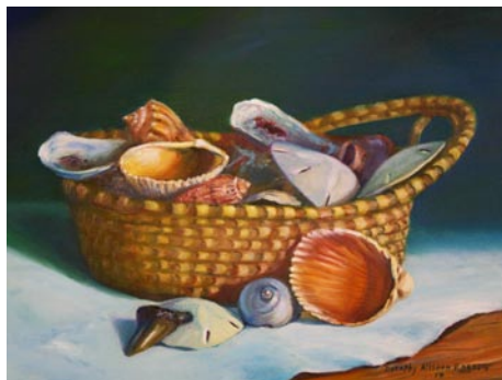
Work by Dorothy Allston Rogers

Rogers is a sixth-generation Charleston native, growing up the youngest of 10 children in a farming family on property overlooking the Intra-Coastal Waterway just