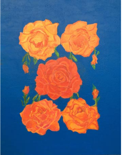
Work by Pat Merriman

that emerges from the desert's surface never ceases to amaze me. I see this contrast in the striking grain of the wood, grain that varies from almost blond to deep brown. Ironwood is the surface upon which I have built my life's work."