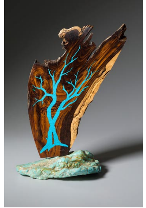
Work by Larry Favorite

"Ironwood trees grow out of the hot sands of the desert, a surface that is constantly changing, continually shaped and reshaped by desert windstorms. The contrast between the shifting sands of the desert, and the solid, almost rock-like ironwood