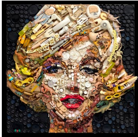
Work by Kirkland Smith

husband and four children. She maintains a work space at Stormwater Studios in Columbia, SC.