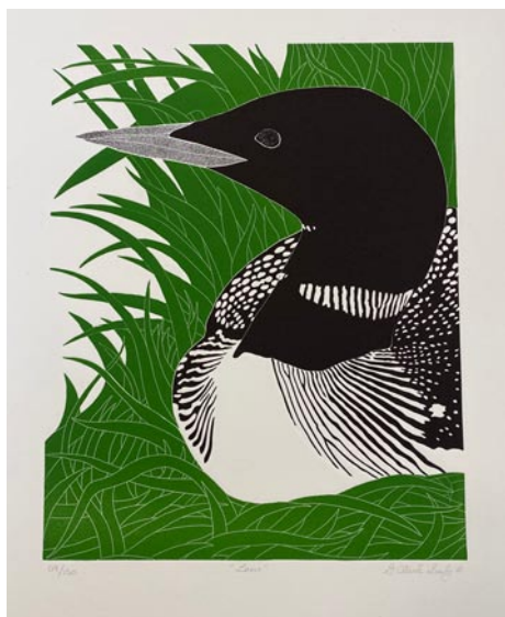
Work by G. Clark Sealy

The body of work available for bid includes a private collection of vintage prints and posters from an anonymous donor. The Great Frame-Up, a Bluffton frame shop, donated plastic sleeves for