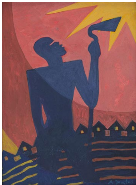
"The Toiler" by Aaron Douglas

Hailed by The Magazine Antiques with having staged a "quiet art historical revolution" and expanding "the meaning of regional" through its "exhibitions, loans, publications, and institutional partner-