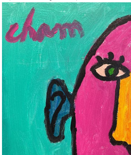
Work by Cham Little

ALTERNATE ART SPACES - Greenville Centre Stage Theatre Gallery , 501 River Street, Greenville. Through Oct. 1 - Featuring works by Cham Little. "People often ask me what I see in my work. I see beauty in the colors. It doesn't have to be a particular subject. I would hope that my art could be enjoyed without understanding what it represents, but for the joy it brings and for the way the colors somehow come together." Ongoing - Featuring works by visual art members of MAC. Exhibits are offered in collaboration with the Metropolitan Arts Council. The exhibit can be viewed virtually at ( www.greenvilleARTS.com/virtual-gallery ). Hours: Tue.-Thur., 2-5pm & 2 hr. prior to shows. Contact: MAC at 864/467-3132, at ( www.greenvillearts.com ).