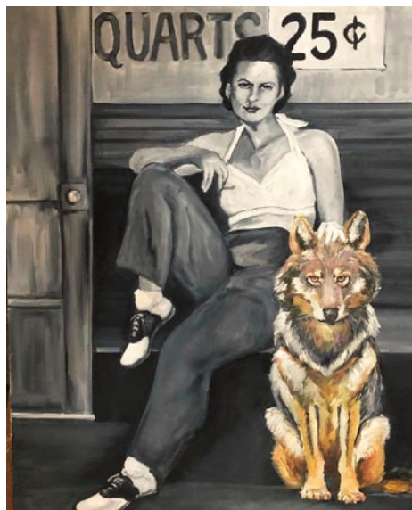
Work by Vanessa Grebe

Grebe is inspired by the images of the past. The old photo cards depicting a simpler, quieter time; the gazes of the subjects...how can one not wonder what they were thinking at that particular moment in time? Often she uses a found photo as a