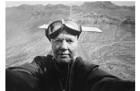
Work by Anne Noggle