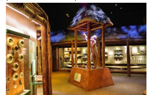
View inside the Museum of the Cherokee Indian

Qualla Arts and Crafts Mutual , 645 Tsali Blvd., across from the Museum of the Cherokee Indian, Cherokee. Ongoing - Featuring basket weaving, pottery, wood carving, finger weaving, beadwork, stone carving and fine painting by members of the Eastern Band of Cherokee Indians. Artisans must go through a juried process to become affiliated with the organization and current membership stands at about 300. Hours: open daily, year round, with seasonal hours. Contact: 828/497-3103 or at ( www.cherokee-nc.com ).