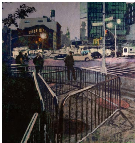
Work by Jeff Kinzel

In a synthesis of emotion and intellect, her works of art regard the dressing table and wardrobe in metaphor to reflect qualities of the feminine, consider aspects of womanhood, explore identity, and commemorate the human condition. Celebrating aspects of femininity by drawing influence from the past and memories, Rust's work investigates the internal lives of women by