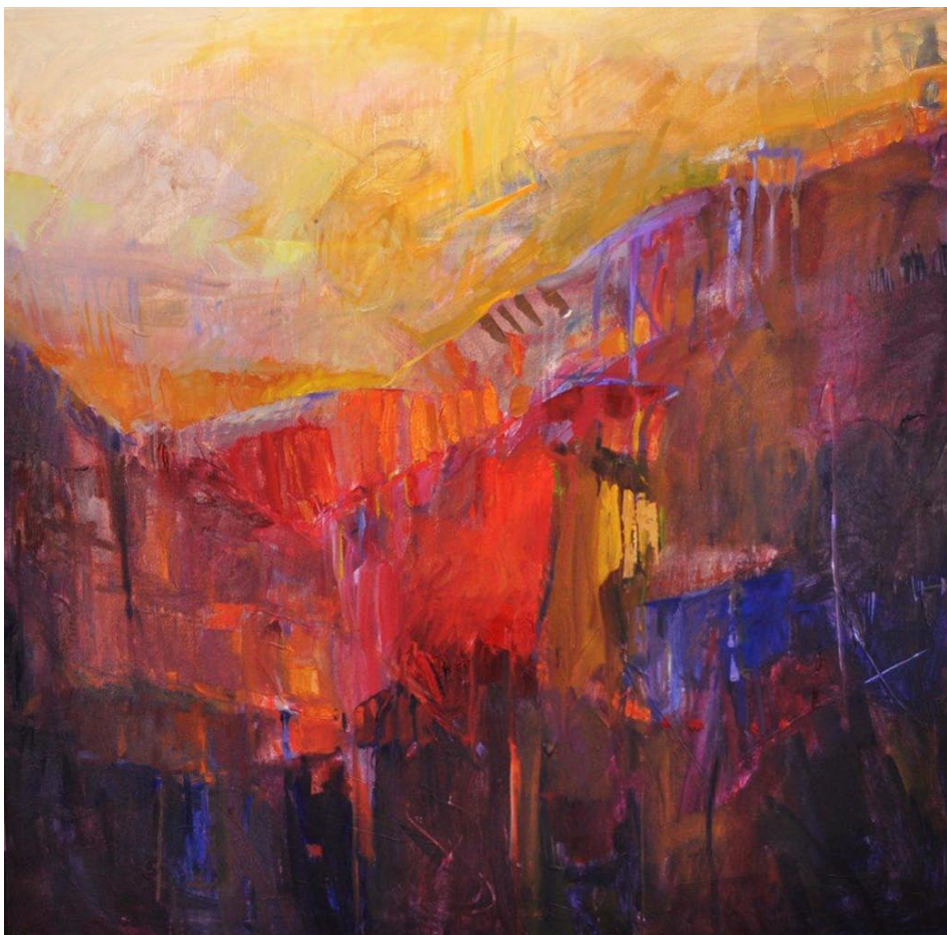
Summer Heat, Oil on Canvas