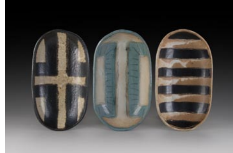
Works by Courtney Martin

The 5th Annual Spruce Pine Potters Market will take place at the Cross Street Building in downtown Spruce Pine, NC, n Oct. 8 & 9, 2011, both days from 10am-5pm. Admission is free and light breakfast and lunch options will be available on site, served by Little Switzerland Café.