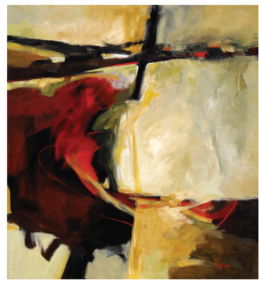
Intention Oil on Canvas, 72 x 66 inches

list of collectors serves as confirmation that her interpretations hit close to home, reminding viewers of many favorite spots in and around the Charleston area.