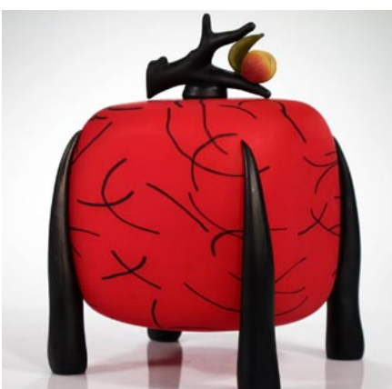
Art To Light Your Way Glass Lantern by Melanie Leppla