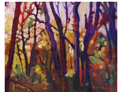
Work by Keith Spencer

near Tryon in 2007, I began working with compositions that were based on the vertical lines and background colors of the wooded landscapes around me," he said. "The paintings in this exhibit reflect the place I wanted to be at this point in my life. They are an honest amalgam of simple images and the emotions they elicit...whether primal or intuitively. I'm not sure solace can be a permanent state of being, but I've learned to notice those moments and enjoy them when they do occur. Maybe we all need a little more solace in our lives."