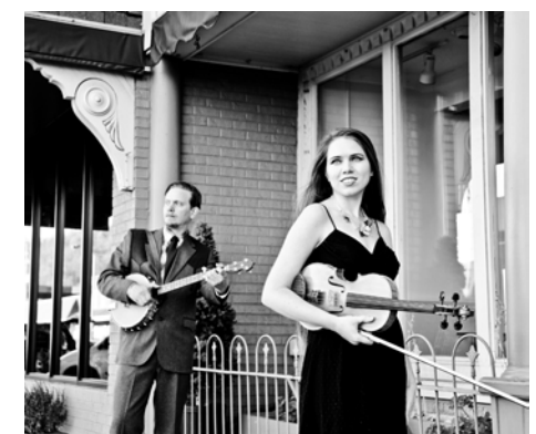
Whitetop Mountaineers.

At 3pm – Moore Brothers Band. Led by a duo of young brothers from Hickory, NC, this band plays bluegrass and gospel.