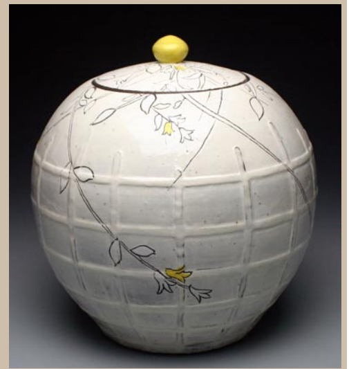
Work by Ben Carter

If you like what you hear you might want to sign up for the newsletter. To join the list click the following link and sign up in the box below the streaming player: ( http://www.carterpottery.blogspot.com/2009/05/welcome-to-tales-of-red-clay-rambler.html ).