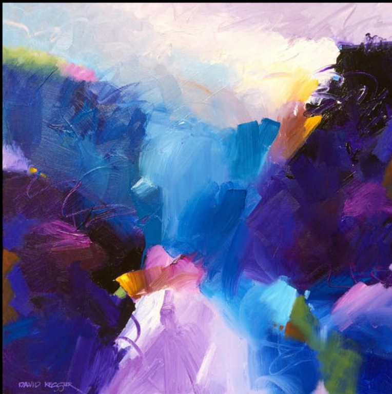
Tidal Shift 3, 36x36 Acrylic on Canvas