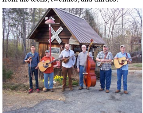
Southern Cresent Bluegrass

Oct. 17, at 3pm – Hot Duck Soup. Ladies and Gentlemen, prepare yourselves for a jolt to your funny bones; the Hot Duck Soup Novelty Vintage Jazz Band is about to assault your senses with wild and zany tunes from the teens, twenties, and thirties!