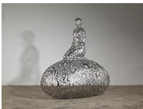
Jaume Plensa, "Nuage VI", 2014.

Jaume Plensa (Spanish, b.1955) has presented more than 35 projects spanning the world in such cities as Calgary, Chicago, Dubai, London, Liverpool, New York, Nice, Seattle, and Tokyo. The winner of many national and international awards, including the 2013 Velazquez