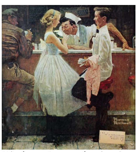
'After the Prom." 1957. Tear sheet, Cover illustration for The Saturday Evening Post, May 25, 1957