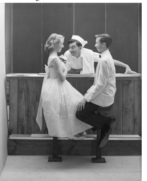
Reference photo for Norman Rockwell's After the Prom, 1957.

This is the first exhibition to explore in-depth Rockwell's richly detailed study photographs, created by the artist as references for his iconic paintings. Rockwell is known for his depictions of everyday life created with humor, skill, and emotion. However, it is little known that he staged photographs to make his popular covers of the Saturday Evening Post. The exhibition includes 50 photographs that show the careful procedure Rockwell used to make his art, as well as 16 original paintings and drawings, and takes viewers behind the scenes in the creative process of one of America's great masters.