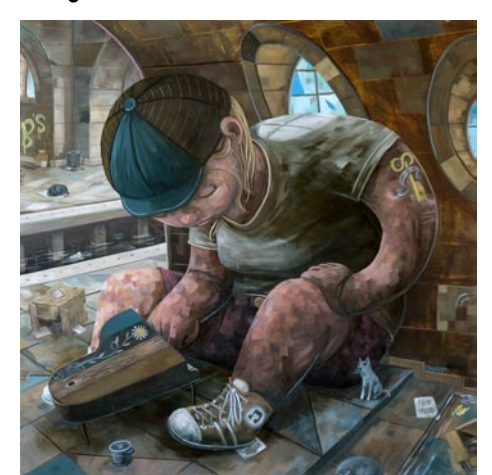
Work by Nathan Durfee

Durfee's painting style is a contemporary update of folk meets pop-surrealism and continually exceeds the expectations of