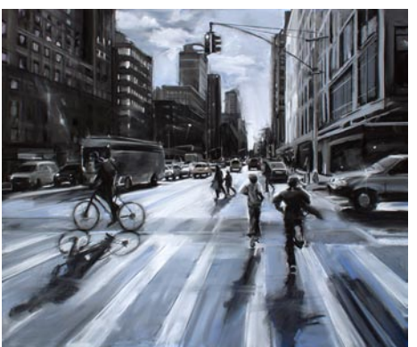
Work by Susan Grossman

Jerald Melberg Gallery in Charlotte, NC, is presenting Susan Grossman: In Motion , showcasing new work by the artist, on view through Oct. 31, 2015. The exhibition features drawings on paper in charcoal and pastel. Grossman absorbs our attention irrevocably with her luminous, shimmering drawings, The monochromatic work glows with a cinematic quality through flashes of color that the artist couples with strong compositional and perspectival effects. For further information check our NC Commercial Gallery listings, call the gallery at 704/365-3000 or visit (www.jeraldmelberg. com).