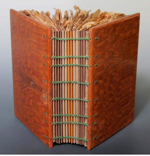
Mixed Media Printmaking Claire Farrell

Opening Reception 5:00- 8:00 October 9, 2015