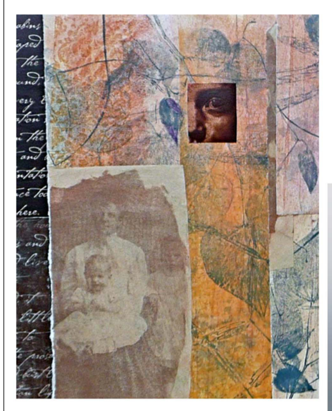
Mixed Media Printmaking Grace Rockafellow